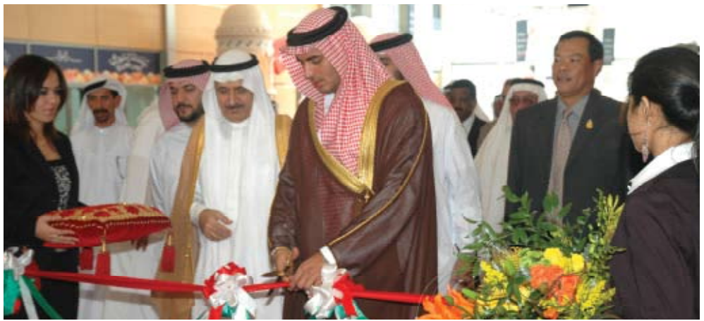
H.E. Sheikh Tariq bin Faisal Al Qassimi, Chairman of Sharjah Economic Development Department, inaugurating Texpo, Arab Asia Trade Fair, and Food Festival at Expo Centre Sharjah on September 18, 2006

Among the displays at Texpo were garment machinery, design/styling/textile dyeing and finishing equipment, industrial sewing machines, cutting machinery, inspection and testing equipment for the garments and textile industry, press machines including steam irons, micro steam generators and components, accessories including trimmings, tailoring items, plastic and metal zippers, laces and buttons, and technology covering CAD/CAM/CIM, software for designing, data monitoring and processing.